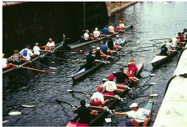
FISA International Tour of the Rideau Canal, 2002

So whether you were inspired by our Canadian team at the Olympics, whether you are a nature enthusiast or whether you are looking to change up your training schedule and try a new activity, rowing might indeed be for you! Touring with the Ontario Adventure Rowing Association may be the best way to explore this sport.